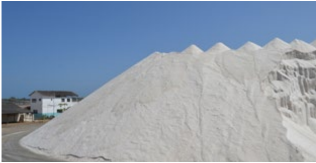
► Heap of unrefined salt