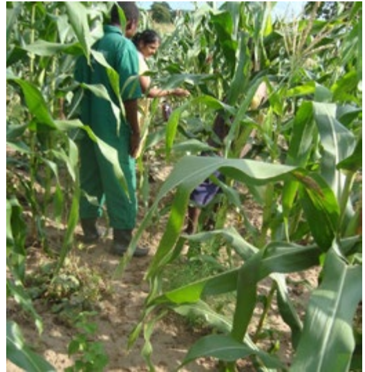
A team from Krystalline Salt Ltd showing an out-grower farmer how to intercrop his biomass plantation with maize and other fruit trees; a mother attending to her nursery in readiness to sell to the company

The company has also planted trees within the compounds of Marereni Primary and Secondary schools. They have also participated in planting of mangroves at Robinson Island.