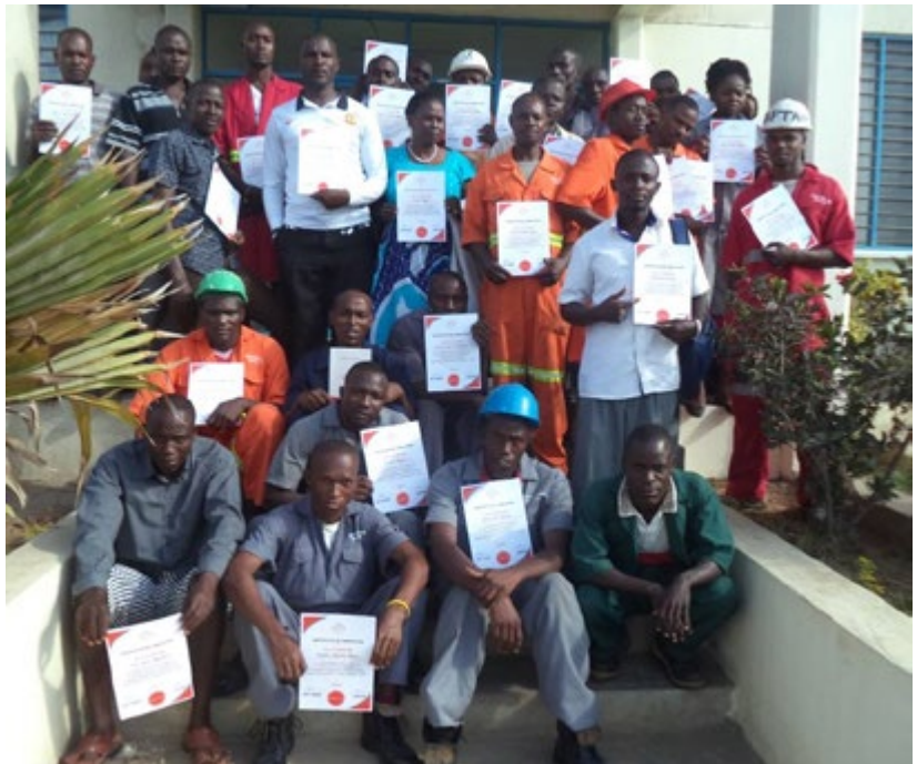
Health and Safety committee, fire marshals and first-aiders display their certificates after training at Krystalline Salt Ltd.

The company has put measures in place to ensure that workers perform their roles in an environment which does not expose them to “hazardous substances, agents or processes”. These include an internal health and safety committee that does regular inspection and investigation of injuries and provide weekly reports on departmental health and safety related issues.