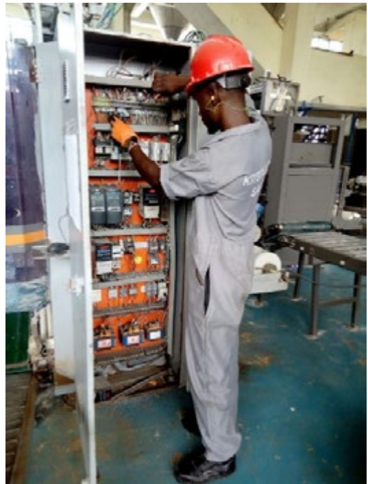
One of the interns working on a machine's control panel.

Annually, over 3000 students from schools visit the company from Universities, Secondary and Primary Schools for educational experiences and learning opportunities.