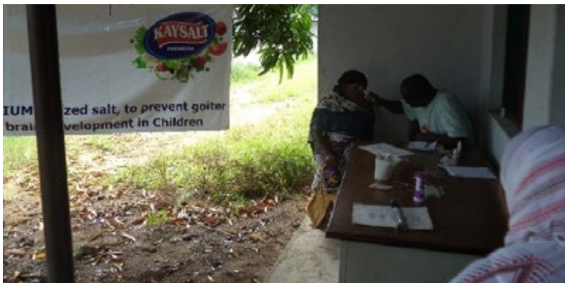
Eye screening services being offered to a community member in Gongoni during an Eye Camp.

Before 1988, there was no dispensary in Magarini area. It's the company that established one. A ward was constructed in 2005 and a second block completed 2015. The facility provides a range of services to the local community, and it is now one of the highly recognized dispensaries in Kilifi County because of their facilities, achievements and commitment to improved healthcare in the County. The dispensary also has a maternity ward constructed in 1988, being the first maternity ward ever in Magarini. The company is currently constructing a modern outpatient Block at the dispensary. The company also has continued to stock the dispensary with drugs and medical kits on annual basis.