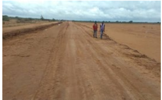
Public access roads at the perimeter fence and in-between the ponds.

From Marereni to Robinson Island along the perimeters.