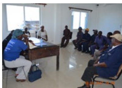
Workers FGDs at Malindi Salt