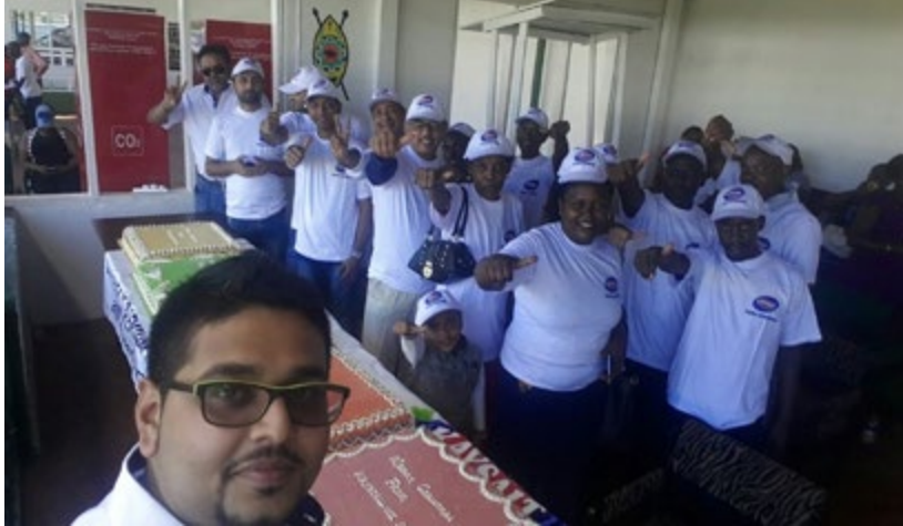
Krystalline Salt Limited team getting ready to celebrate Christmas with the homeless children. They surprised the children with cakes.