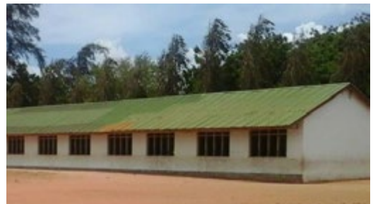
Students and teachers at Boyani Primary school receiving desks; and the 15 classrooms constructed at Marereni Primary School by Krystalline Salt Ltd.

The Company has contributed to the construction of 15 classrooms in Marereni primary school which has an enrollment of 1780 learners. The company constructed the administration block and a water tank as well as fenced the school.