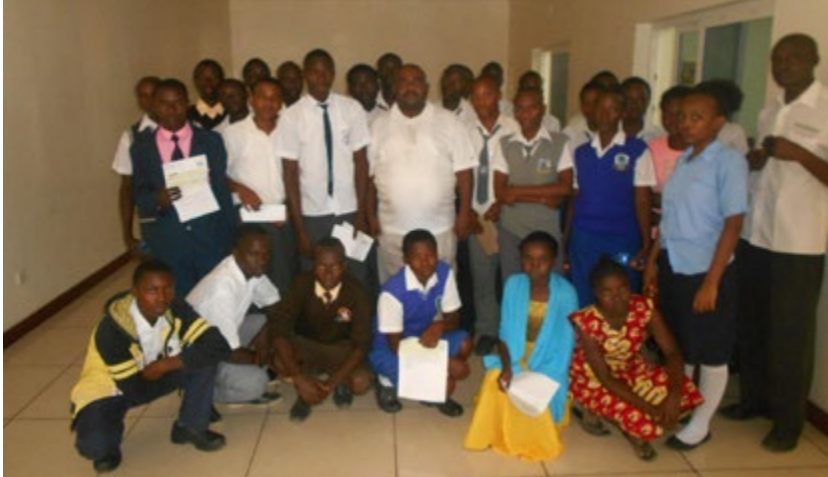
Some of beneficiaries after receiving their cheques for sponsorship by Kensalt