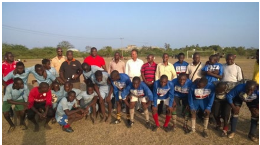
Magarini and Adu Football teams with KSL Management during a tournament.

The company indicated that it has supported various Football Clubs in Magarini through sponsoring tournaments and trophies. In December 2015, they funded Adu Ward Sports Committee and Gongoni sub-location football committee through sponsorship of the tournaments they had planned for the festive season.