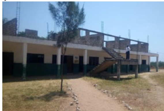
Storey building at Kami ya waya primary.

Support is given to Kambi ya waya Primary School where a storey building of eight (8) classrooms and two (2) offices have been constructed. Out of the eight (8) classrooms, four (4) are already completed. One office is in use and it is projected that the building will be completed as planned. The company pays salaries for three teachers based at Kambi ya waya, Kibaoni and Kinyaole Primary Schools. Needy students have been beneficiaries of a bursary scheme started by the company.