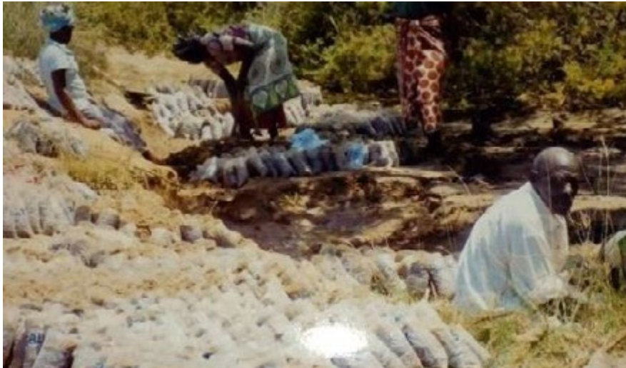
Members of community preparing the mangrove seedling for planting at Kurawa industries.