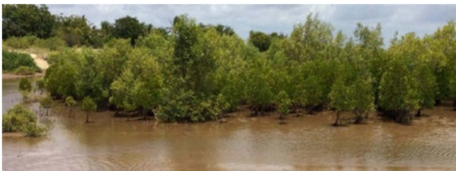
Mangroves planted by Krystalline Salt Ltd at the Robinson Island.

In addition the Salt Company has planted one million casuarina trees that act as a buffer zone between the mangroves and their operations site. The buffer zone protects the mangroves from invasion.