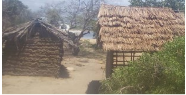
Semi permanent houses erected by fishermen on the Krystalline Salt Ltd land in Marereni.