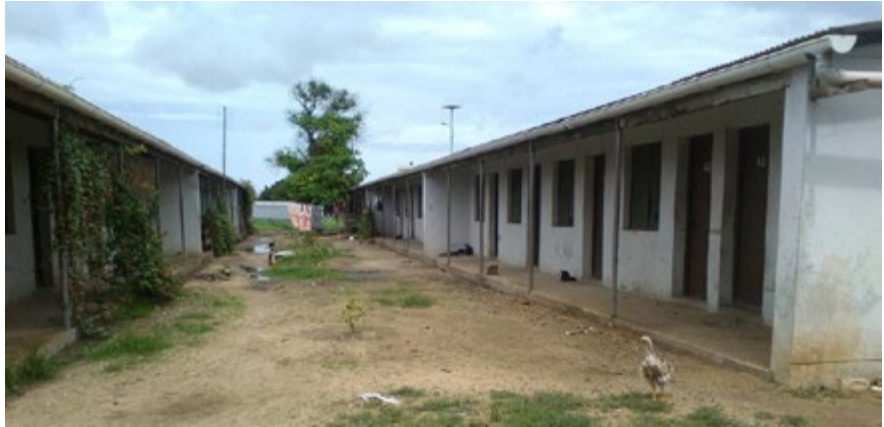
Houses provided for employees at Krystalline Salt Ltd.

The solar project enabled the company to host a team of experts on an exchange program. The team comprised various companies under the membership of KAM.