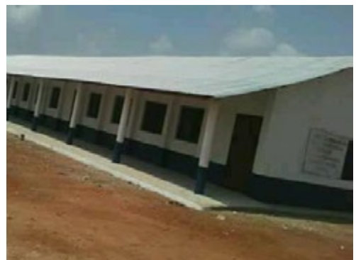
A CSR project under construction with funding from Kurawa Salt Industries.

The salt company also indicated that it pays school fees for needy children through collaborating and supporting the community.