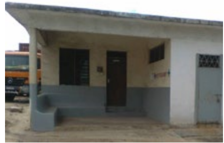
Krystalline Salt Limited in-house clinic and equipped departmental first-aid station.

The injuries are monitored daily. They conduct annual health and safety audit and risk assessment while implementing the recommendations given. They do training to workers on health and safety in relation to the hazards they may be exposed to. The company provides Personal Protection Gears according to the risk hazards that one may be exposed to. The employees exposed to specific hazards are subjected to medical examinations annually and recommendations implemented as per the medical reports. The Company has trained first aiders and well equipped first aid boxes in every department to attend to minor injuries. They also have a dispensary within the company premises to deal with emergencies. On matters remuneration, the company complies with the national minimum wage guidelines.