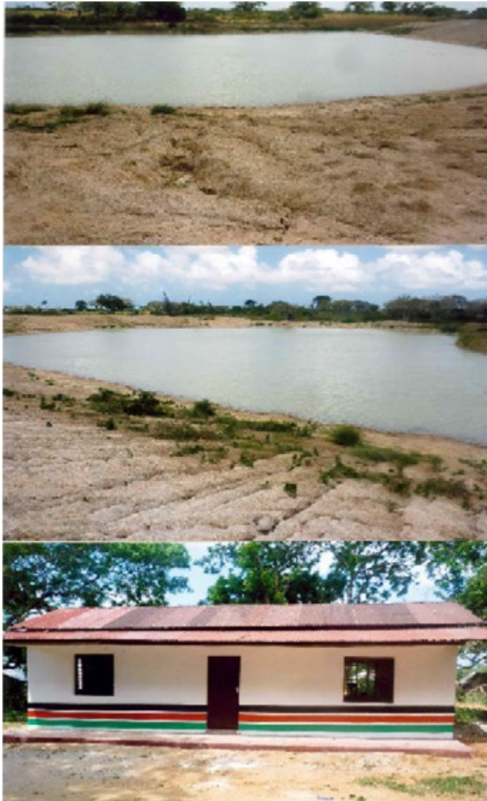
Earth Dams at Kibaoni – Fundisa location and an Asst. Chief's office at Kibaoni Sub-location – Fundisa location.